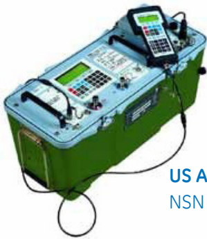
US Army NSN 4920-01-388-6790

Military authorities throughout the world have adopted the ADTS 405F variant as standard equipment such as: