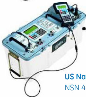
US Navy NSN 4920-01-656-6280