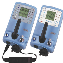
DPI 610 Aeronautical