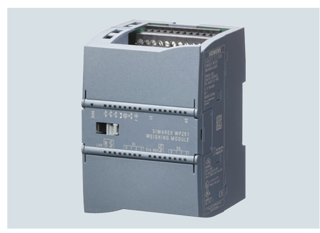
SIWAREX WP251 electronic weighing module

SIWAREX WP251 is a flexible weighing module for dosing and filling processes. The compact module can be installed seamlessly in the SIMATIC S7-1200 automation system. It can also be used without a SIMATIC CPU in stand-alone mode.